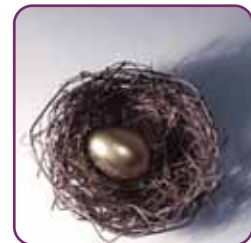
Increased ISA limits