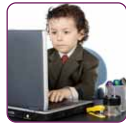
Helping future generations