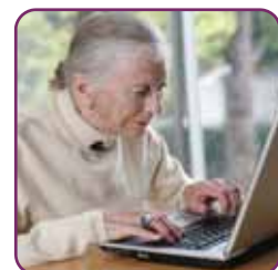
Working later in life?