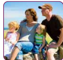
Family income benefit